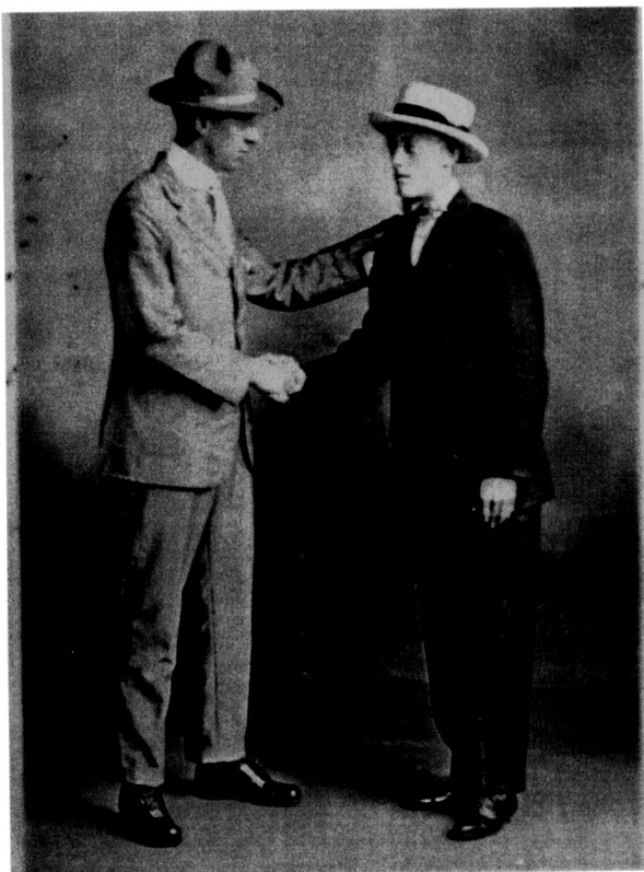
Fig. 4. Two Dandies, Two Brothers.