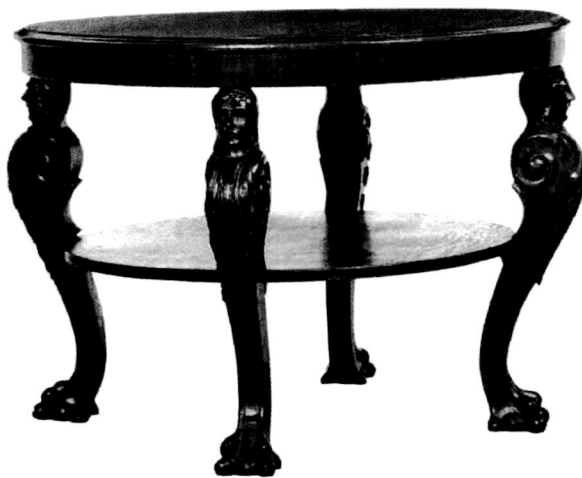
Fig. 2. Picture of Item to be offered in the Flomaton Auction for August.

The next scheduled auctions are August 5th and September 3rd.