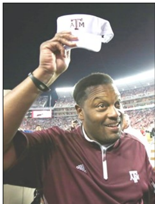
Kevin Sumlin College Football Coach

Born in Brewton in 1964 where his father was the head coach at Brooker T. Washington High School, the family moved to Indianapolis where Kevin was a star player in several sports. He was a starting line-backer at Purdue University. His career as a college football coach began in 1989 at Washington State. His first head coaching job came with the University of Houston in 2008. Presently Head Coach at the University of Arizona.