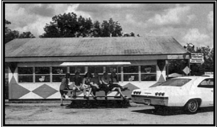
(Left ABOVE) Car hops, though not scantily-clad, were regular features of the Milky Way in Flomaton and the McCurdy Dairy Bar in Century, but not at the Big R, Telstar Drive-In, or Garrett's.