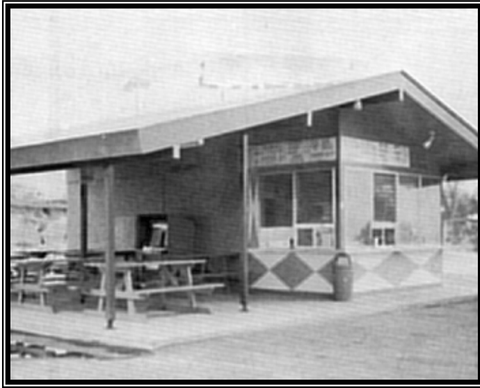
(Left) Big "R" Drive-In - 1962—Located in South Flomaton

First specializing in serving A&W Root Beer in frosted mugs, this was a favorite place for kids to hang out.