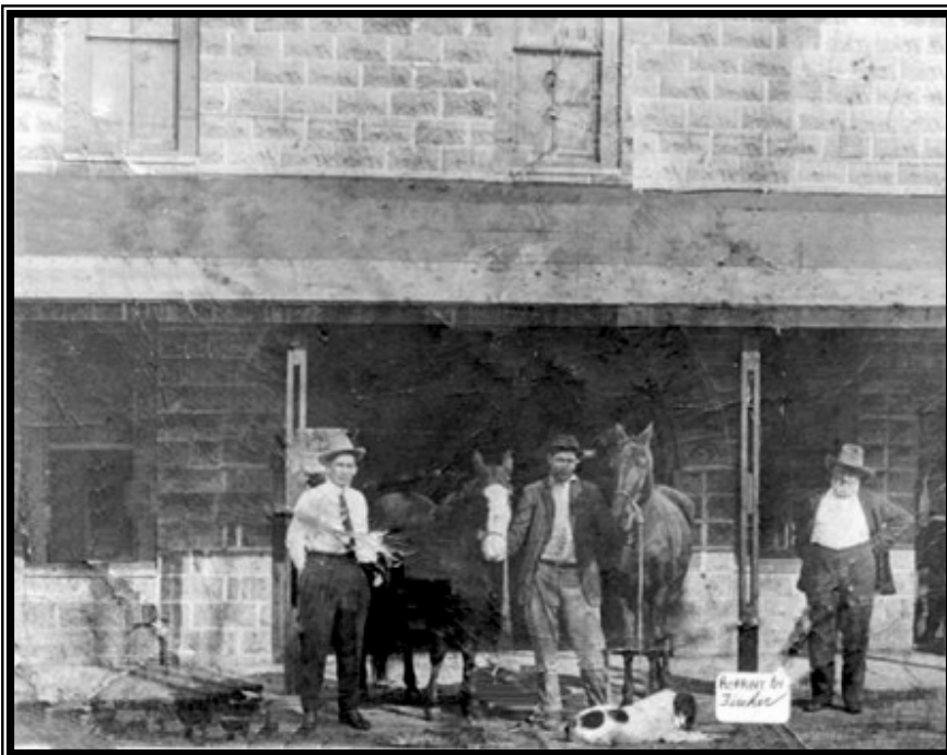
(Left) Jackson Livery Stable circa 1910